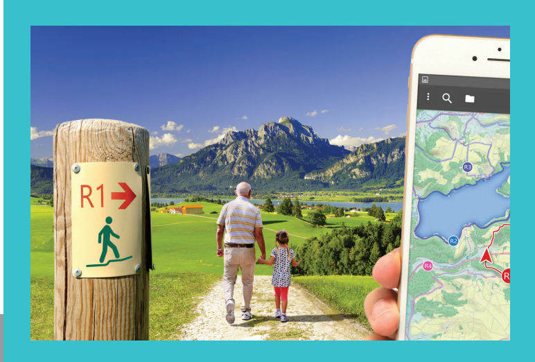
With TECNIS PureSee™ IOL

These images are for illustrative purposes only and do not represent actual data derived from studies. These illustrative simulations are intended to help you better understand your vision in certain eye conditions.